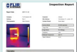
QuickReport™ PC software enables user to analyze Temperature of all JPEG images from miniSD™ card