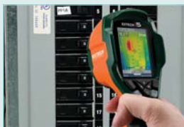
Detect hidden problems fast