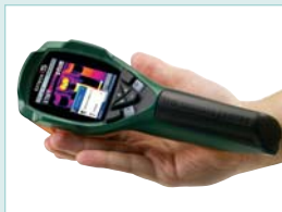
Pocket size and extremely lightweight camera only weighs 12 ounces