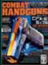
combathandguns.com published 8 times a year