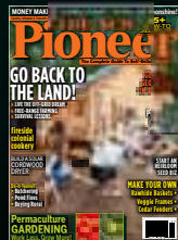
newpioneer.com published 3 times a year