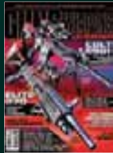
guns-weapons.com published 8 times a year