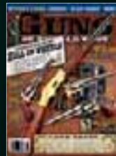
gunsoftheoldwest.com 4 times a year