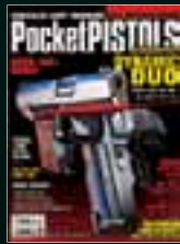
pocketpistolsmag.com published 2 times a year